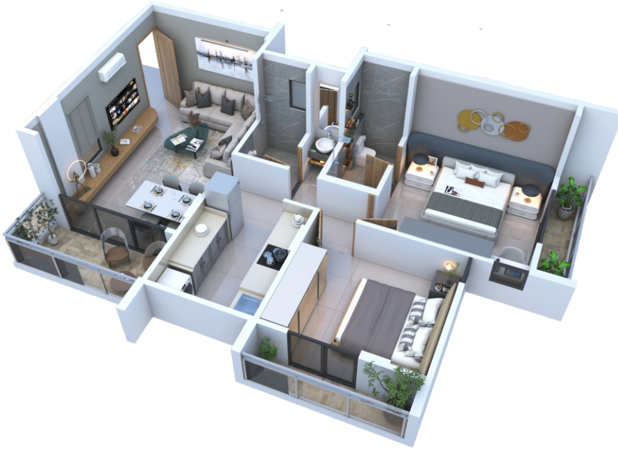
STANDING BALCONY 11'2" x 22" BALCONY 11'4" x 6'0" LIVING & DINING 11'0" x 17'0" KITCHEN 8'4" x 9'0" BEDROOM 11'0" x 10'0" BEDROOM 12'7" x 11'0" BATH 5'0" x 6'0" TERRACE 10'0" x 17'0" STAIRS STANDING BALCONY 22" x 11'2"